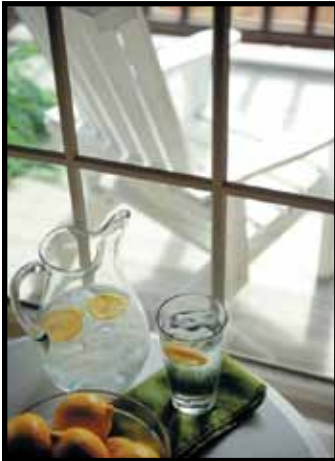
In the kitchen . . .