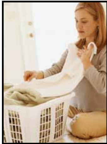
In the laundry . . .