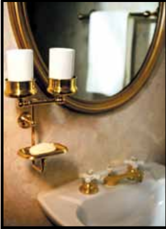
In the bathroom . . .

Enjoy Softened Water Throughout Your Home